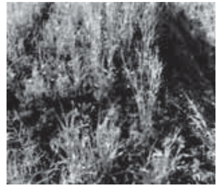
A green manure crop of ryecorn and vetch helps improve the soil on a vegetable block.